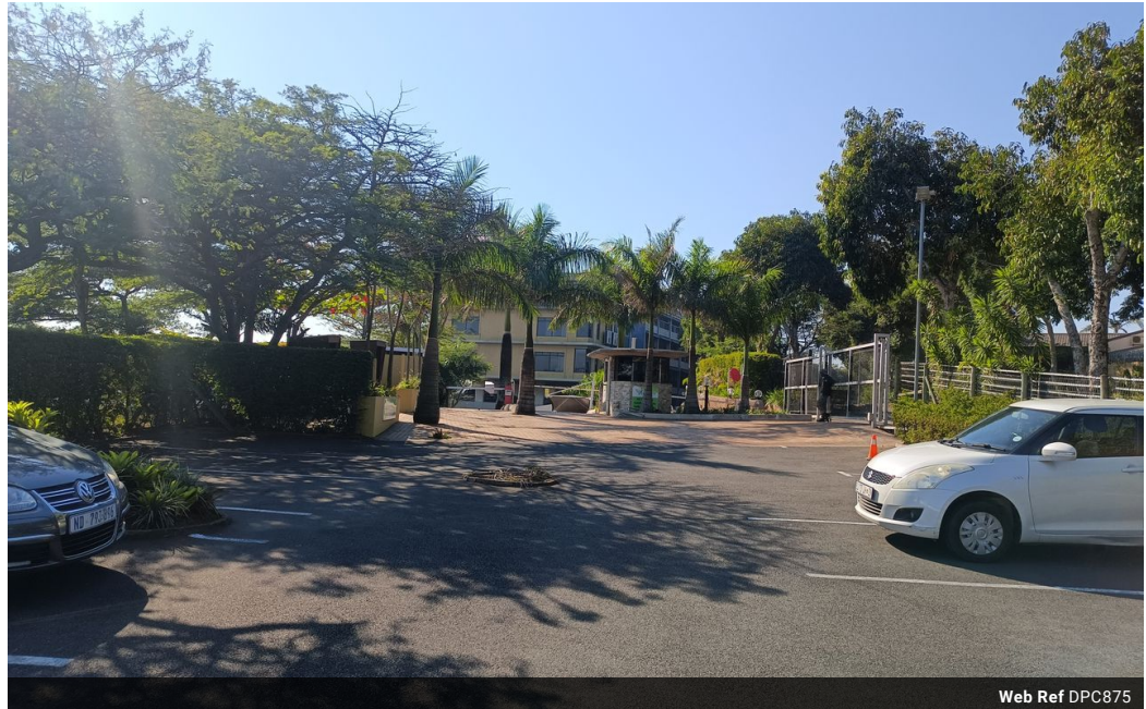
Web Ref DPC875