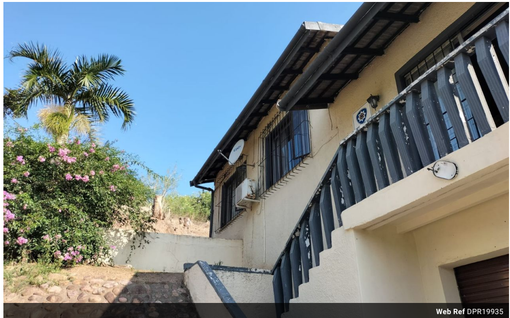
Web Ref DPR19935

558 Mountbatten Drive Reservoir Hills Durban 4090