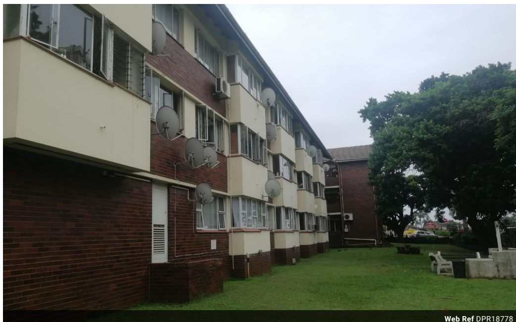
Web Ref DPR18778

3 Oslo Building 394 Ester Roberts Road Glenwood Durban 4001