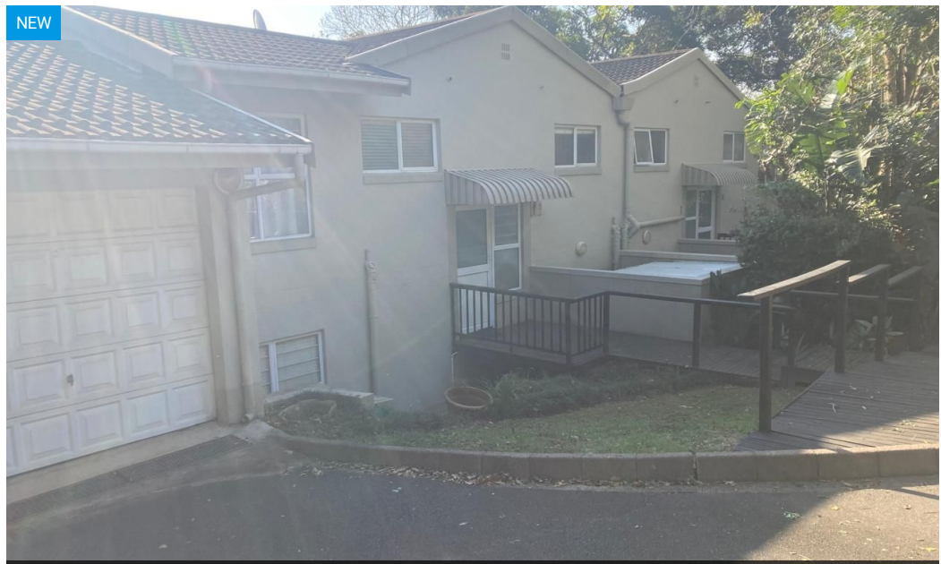
SOLE MANDATE Web Ref DPR20256

1 Knightbridge, 16 Westville Road, Westville