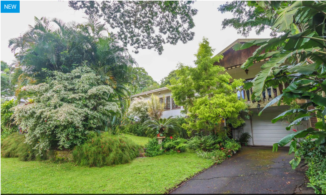
ON SHOW, SOLE MANDATE Web Ref DPR19106

Directions Boards to princess Anne place