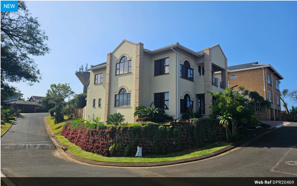
Web Ref DPR20469

Contact Amanzimtoti 031 9035260 41 Beach Road Amanzimtoti 4126