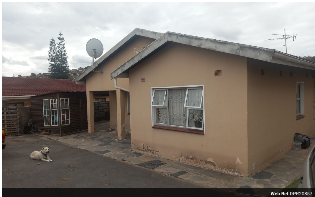
Web Ref DPR20857

343 Anton Lembede Street 511 Perm Building Durban 4001