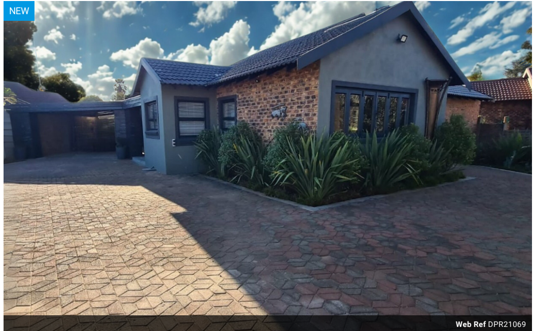
Web Ref DPR21069

Vision 21, Industrial Park, Shop 26, Steel Road, Duncanville, Vereeniging