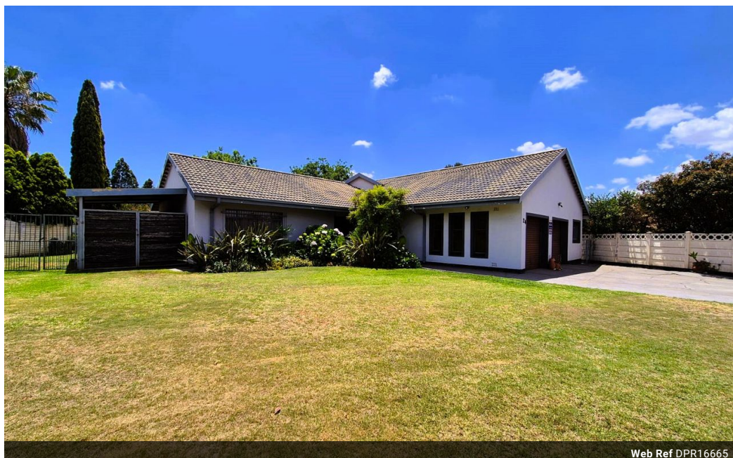
Web Ref DPR16665

18 Klipriver Drive Three Rivers Vereeniging