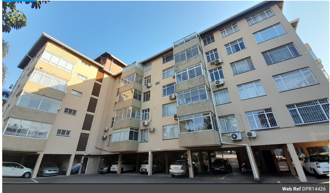
Web Ref DPR14426