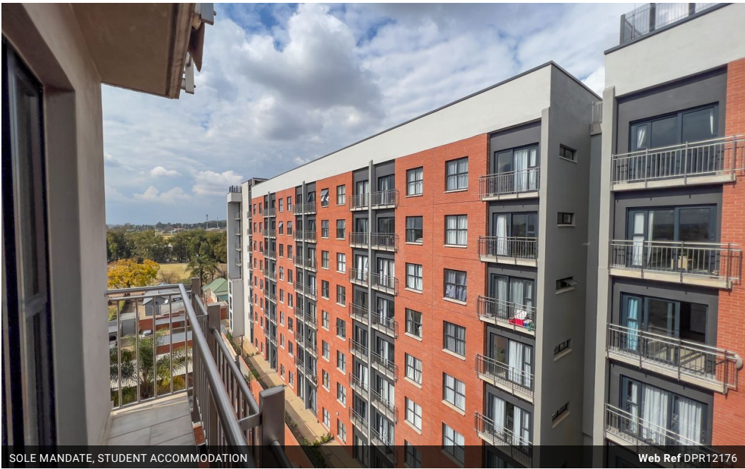
SOLE MANDATE, STUDENT ACCOMMODATION

Contact Student Accommodation 012 3625499 7 Arlon Place, 1299 South Street, Hatfield, Pretoria