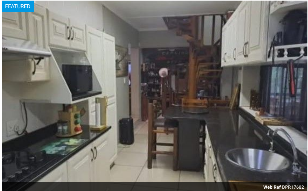
Web Ref DPR17682