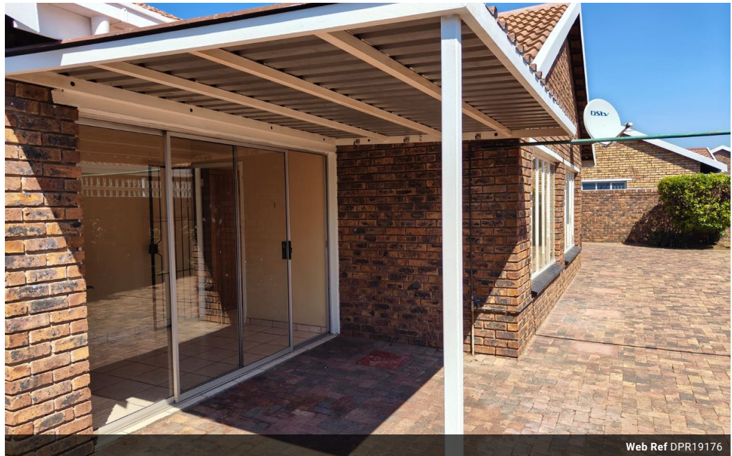
Web Ref DPR19176

18 Klipriver Drive Three Rivers Vereeniging